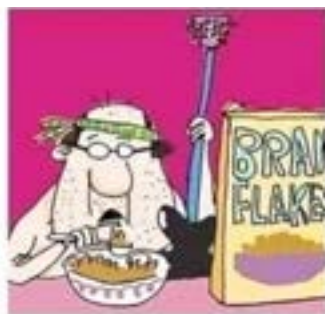
Earth, Wind and Fiber