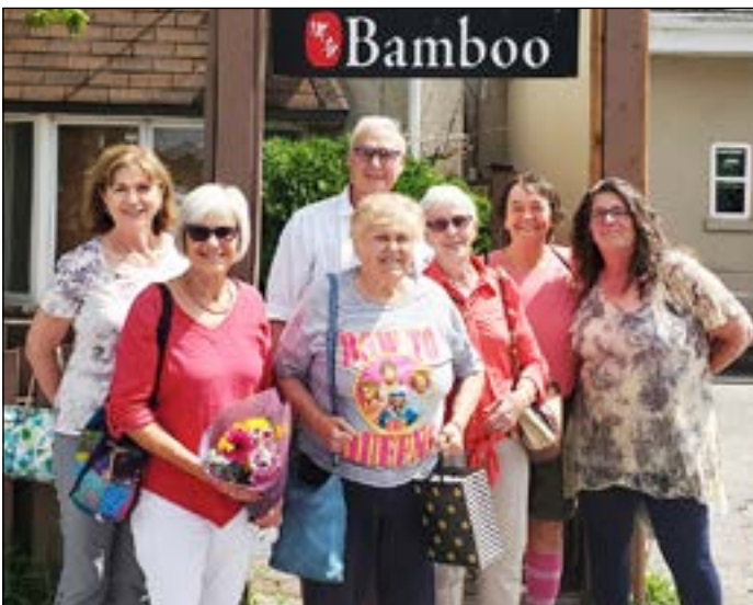
Cast of “The Golden Girls” (members of the Acting for Fun Interest Group) celebrated their recent performance for the PROBUS meeting in July, at Bamboo restaurant.