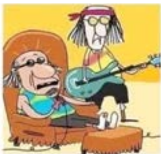
The Grateful we’re not Dead